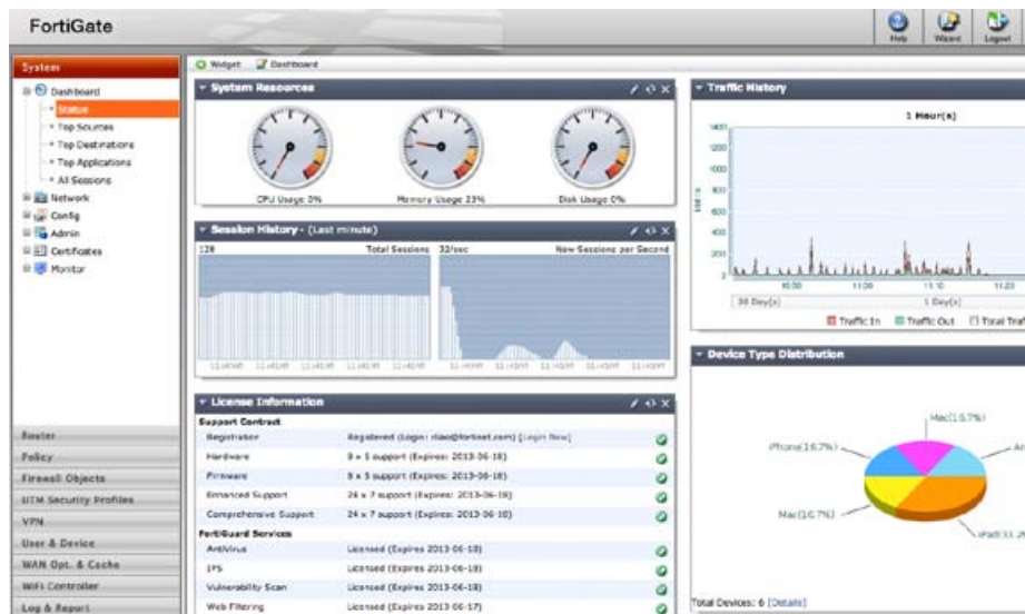
FortiOS Dashboard — Single Pane of Glass Management

Fortinet FortiGuard Subscription Services provide automated, real-time, up-to-date protection against the latest security threats. Our threat research labs are located worldwide, providing 24x7 updates when you most need it.